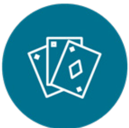
Social and Civic Activities