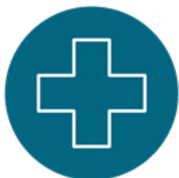
Respite care/ Life-skills