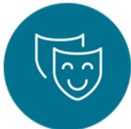
Participation in Community Social and Civic Activities